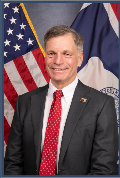
GOVERNOR MARK GORDON KEYNOTE SPEAKER

Mark Gordon was elected Wyoming's 33rd Governor on November 6, 2018. He was sworn into office on January 7, 2019. He grew up on the family ranch in Wyoming where he learned the values of hard work and integrity and the importance of working together. As Governor, he brings those values to the table, maintaining his commitment to a Wyoming where its citizens can pursue their dreams while the state retains its unique character. He is a strong believer that Wyoming must chart its own course, and a steadfast defender of its interests to do so.